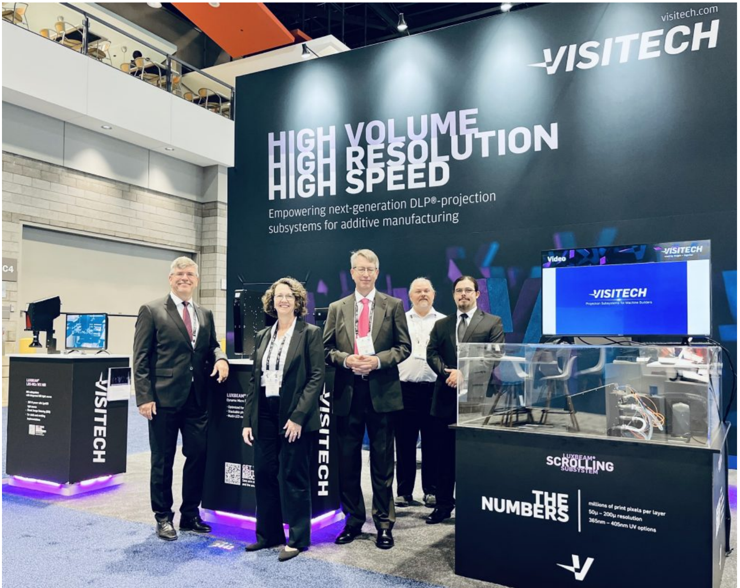
Meeting/greeting all technology and market leaders in the AM world, the US exhibition team